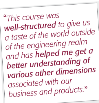
Technology Associate at the Largest Commercial Property Development and Investment Company in the United Kingdom.