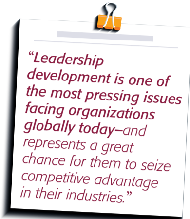
Findings by The Conference Board, Bersin & Associates, and HR analytics expert McBassi & Company