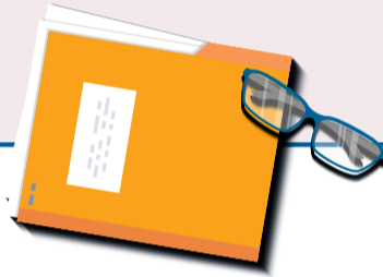
Center for Creative Leadership

86% of companies with strategic leadership development programs are able to respond rapidly. Meanwhile, just 52% of companies with less mature leadership programs could do the same.