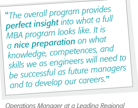
Operations Manager at a Leading Regional Security Coordinators (RSCs) Company.